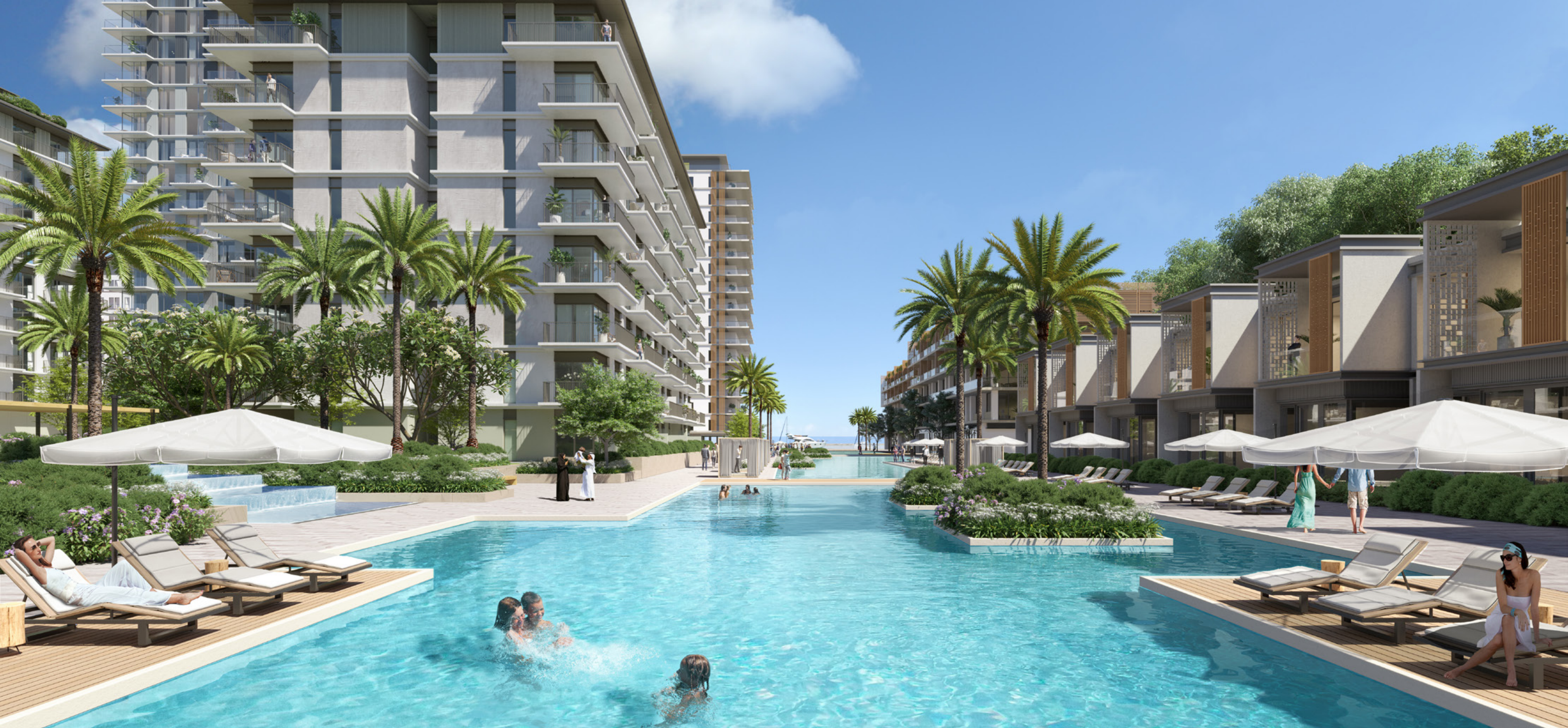
The Canal Pool